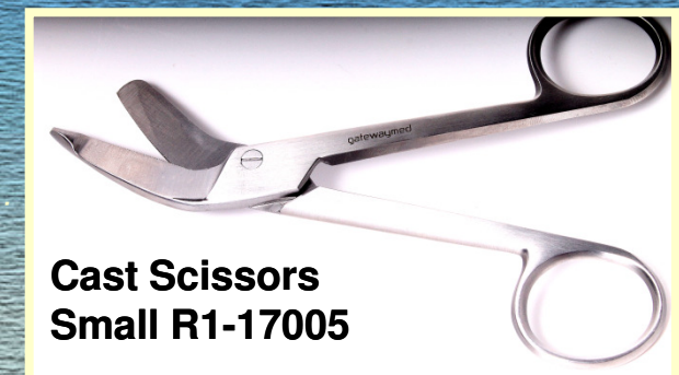
Cast Scissors Small R1-17005

Gateway Medical Inc · 224 Rolling Hill Road · Ste 12A Mooresville, NC 28117 USA Tel: 866. 655. 9040 · Fax: 704. 987. 2035 · sales@gatewaymed.com