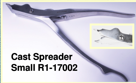
Cast Spreader Small R1-17002