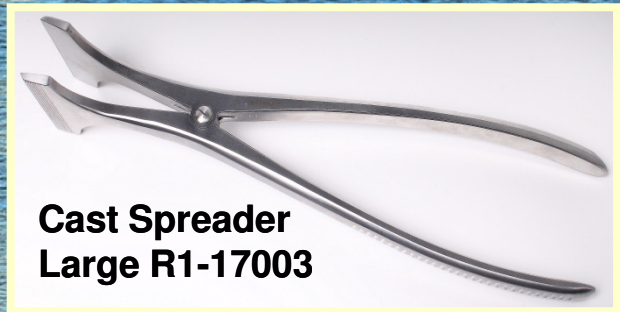
Cast Spreader Large R1-17003