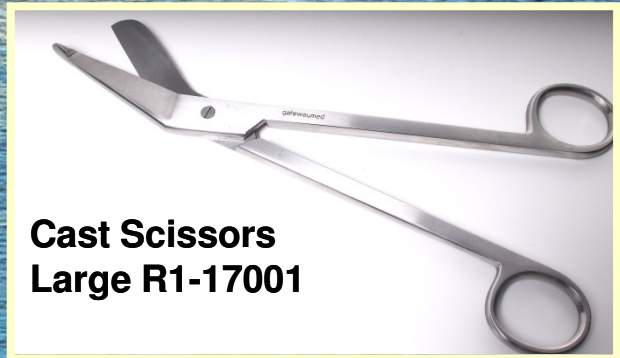
Cast Scissors Large R1-17001