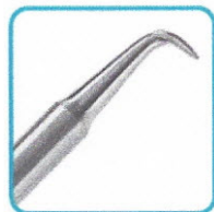
225-600-290 Chondral Pick 90° angled tip