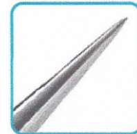
Special hardened steel for reliable working