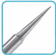
225-600-200 Chondral Pick Straight

Special hardened stainless steel ensures a long life-time of each Pick.