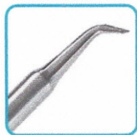
225-600-260 Chondral Pick 60° angled tip