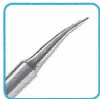
225-600-225 Chondral Pick 25° angled tip