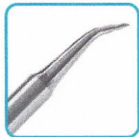
225-600-240 Chondral Pick 40° angled tip