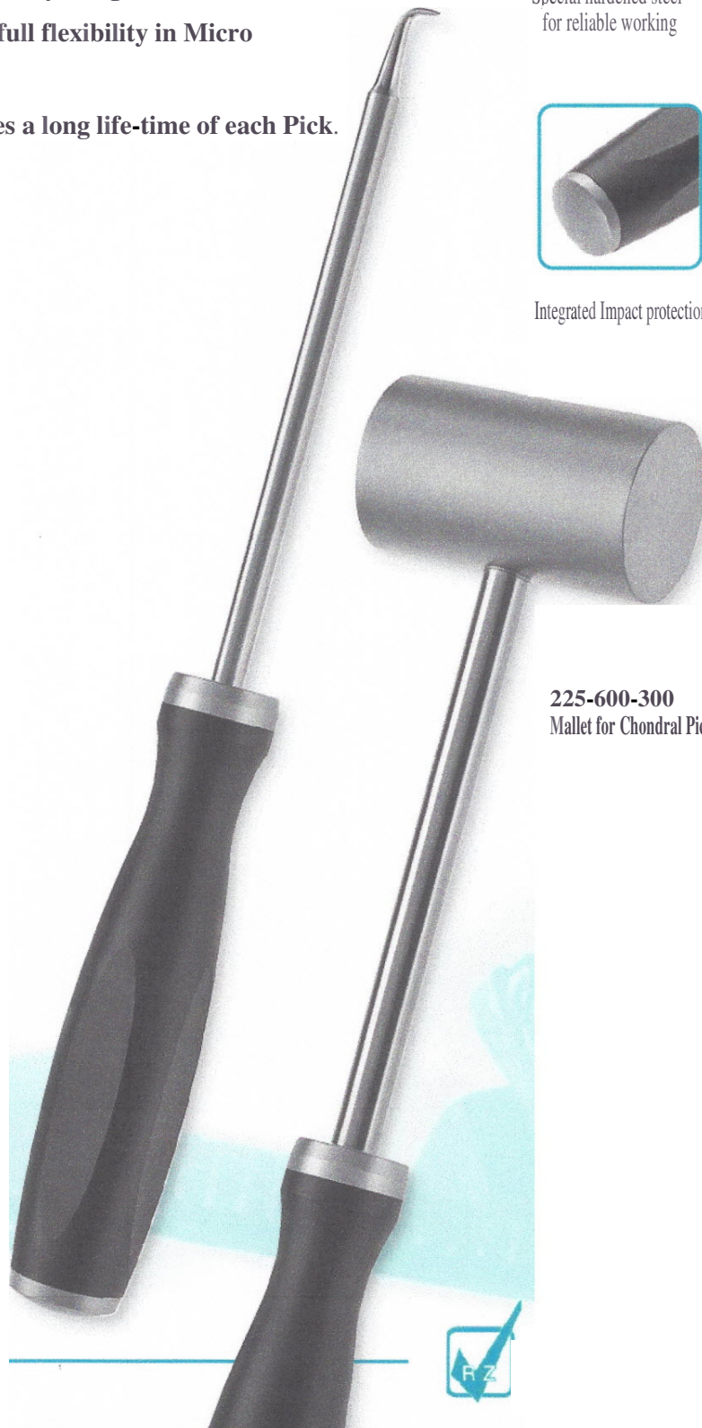
225-600-300 Mallet for Chondral Picks